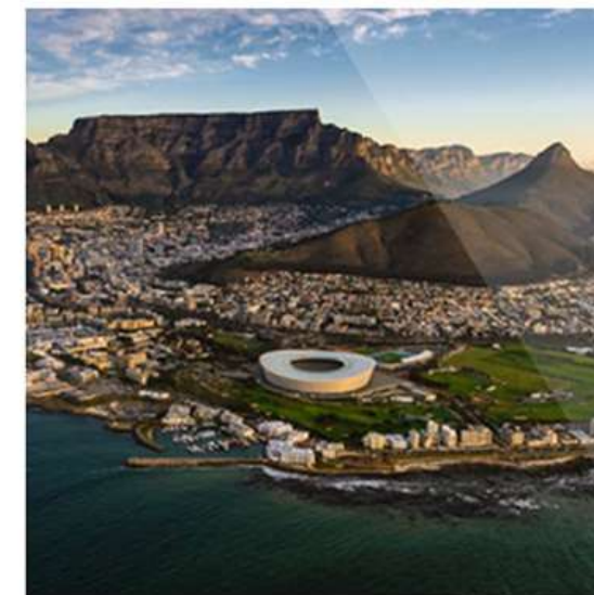
Wings Over Southern Africa