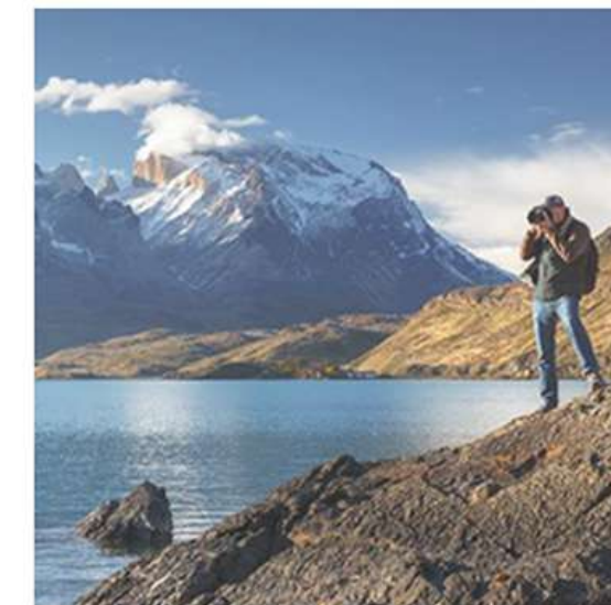
Wings Over Argentina, Chile & Brazil