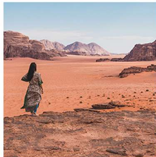
Wings Over Israel, Jordan & Egypt